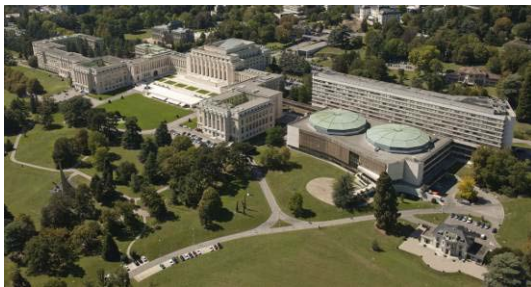
UN in Geneva