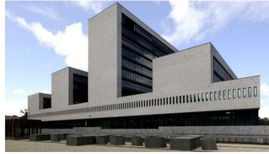
EUROPOL in The Hague