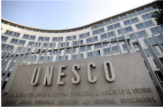
UNESCO in Paris