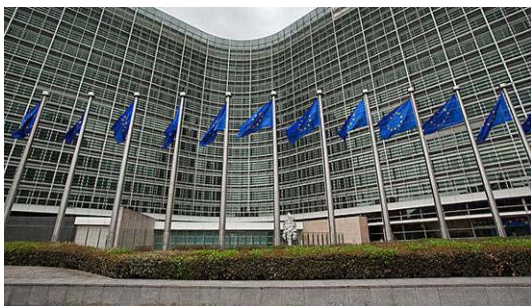
EU in Brussels