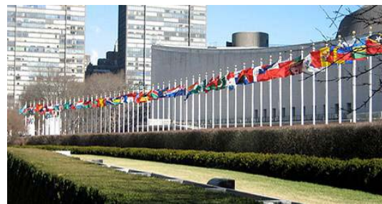
UN in New York