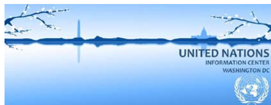
UN in Washington