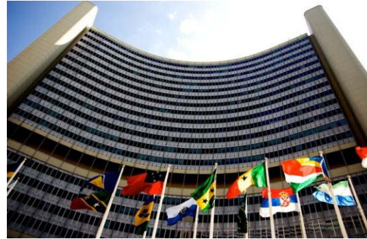
UN in Vienna