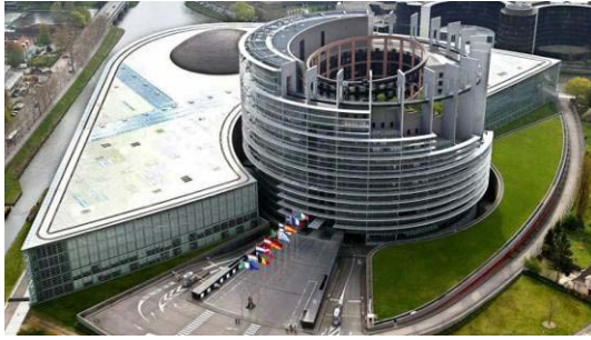
Council of Europe in Strasbourg